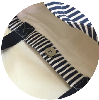
Suma Kancing IDR. 40,900