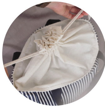
Suma Serut IDR. 48,500