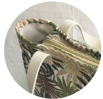
Suma Bisban IDR. 47,700