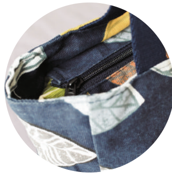
Suma Resleting IDR. 49,200