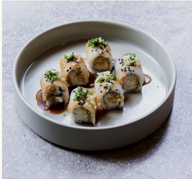
TRUFFLED TAI YUZU ROLL