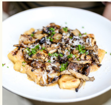
HOMEMADE RICOTTA GNOCCHI