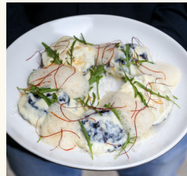
BLACK & WHITE PRAWN RAVIOLIS