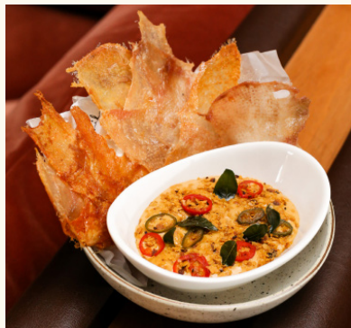
CRISPY CHICKEN SKIN