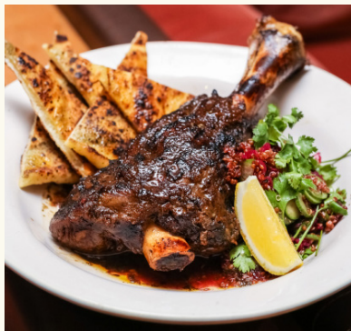
JERK LAMB SHANK