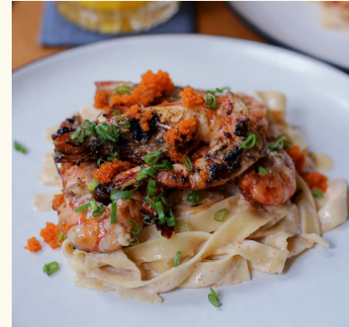
CREAM OF EBIKO NOODLES