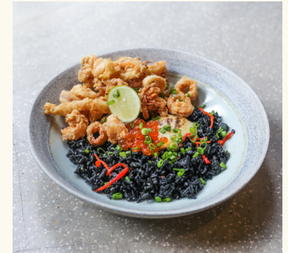
SQUID INK RICE